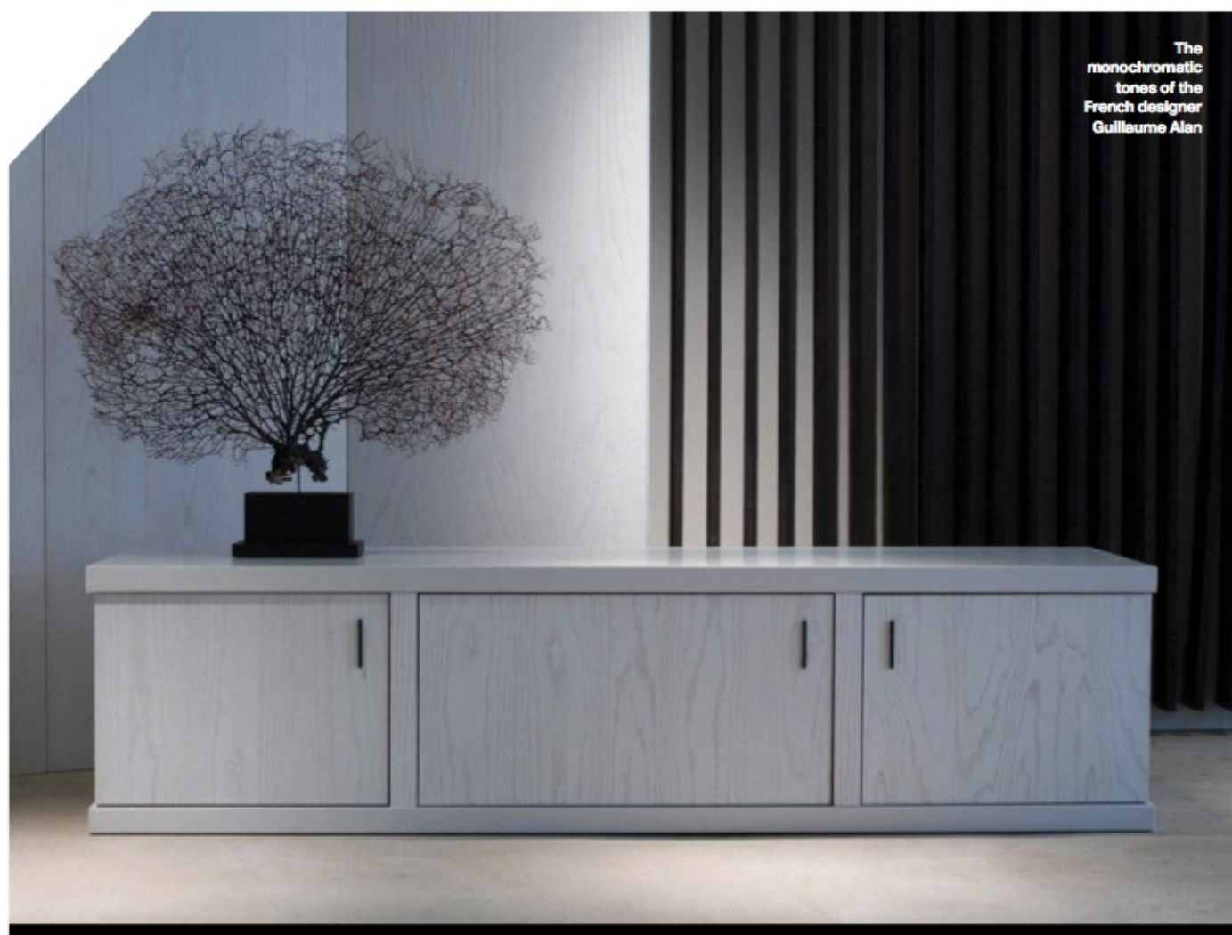
The monochromatic tones of the French designer Guillaume Alan