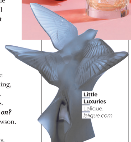
Little Luxuries Lalique. lalique.com