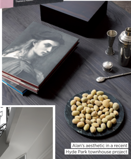
Alan's aesthetic in a recent Hyde Park townhouse project