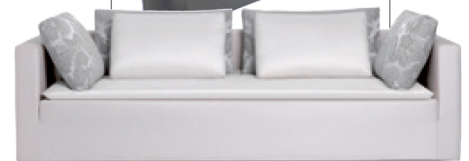
Furniture Guillaume Alan bespoke. guillaume-alan.com