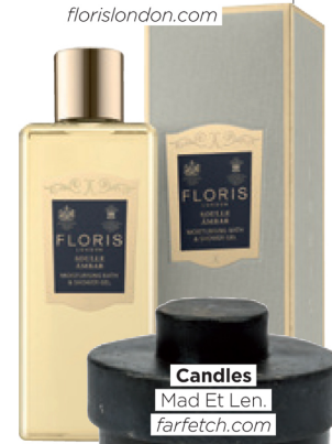
Candles Mad Et Len. farfetch.com