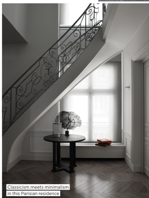
Classicism meets minimalism in this Parisian residence